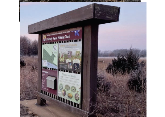
Photo: Take your photo next to this information board. This trail winds through prairie and a short walk will lead you to an overlook on the river.

GPS Coordinates: 42.18282038654205, -90.2524845935209