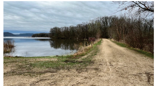
Photo: Take a picture with the with the three-panel kiosk and the wetland view in the background!