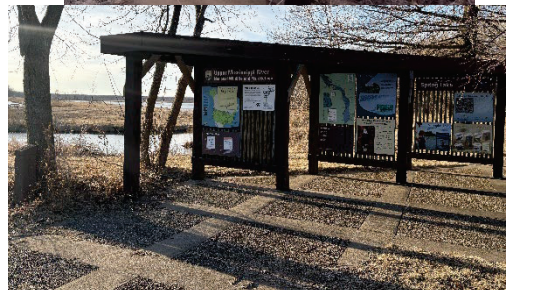
Photo: Take your picture next to the 3 panel kiosk. This is a popular place to view birds during the spring and fall migration.

GPS Coordinates: 42.06478758203184, -90.12605041771093