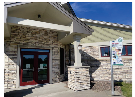
Photo: Celebrate our partnerships and take a photo with the Great River Road sign located outside in front of the Visitor Center. Stop by the Visitor Center to enjoy about 2.5 miles of trails winding through a restored sand prairie! Look and listen for dickcissels, meadowlarks and clay-colored sparrows.