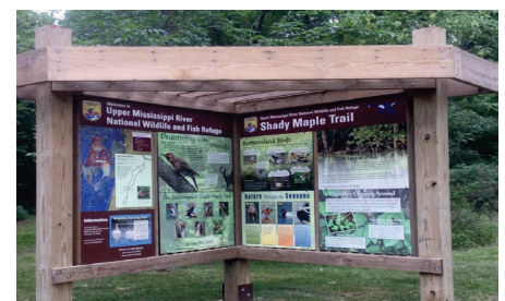
Photo: Take a picture with the two-panel kiosk located at the trailhead!

GPS Coordinates: 43.726664182399894, -91.2145700350287