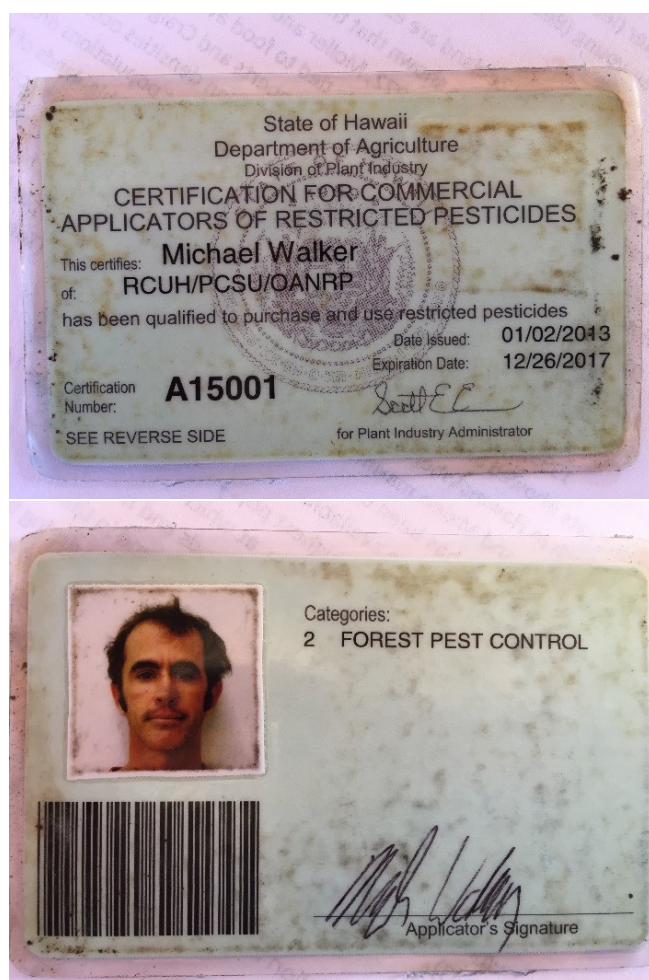
Figure 2: Certified Pesticide Applicator's license.

into the wildlife sanctuary (above the high tide line).