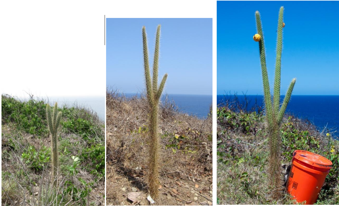
Figure 3. Photos of HarPor 26 (L-R) in Jun 2010 (height = 91.6 cm), March 2011 (118.0 cm), and April 2012 (155 cm) with 2 fruits.

We observed one inaccessible individual (HarPor 29) with what appeared to be 5 or more small white flower buds ( Figure 4 ). Given its distance from the observer, however, it is difficult to confirm this observation.