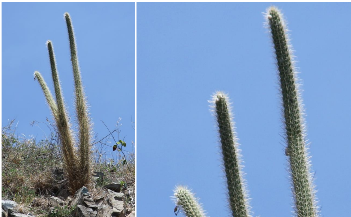
Figure 4. Photo (L) of HarPor 29 on 8 April 2012. Photo (R) of what appears to be 5 or more white flower buds on HarPor29.

We observed one inaccessible individual (HarPor 29) with what appeared to be 5 or more small white flower buds ( Figure 4 ). Given its distance from the observer, however, it is difficult to confirm this observation.